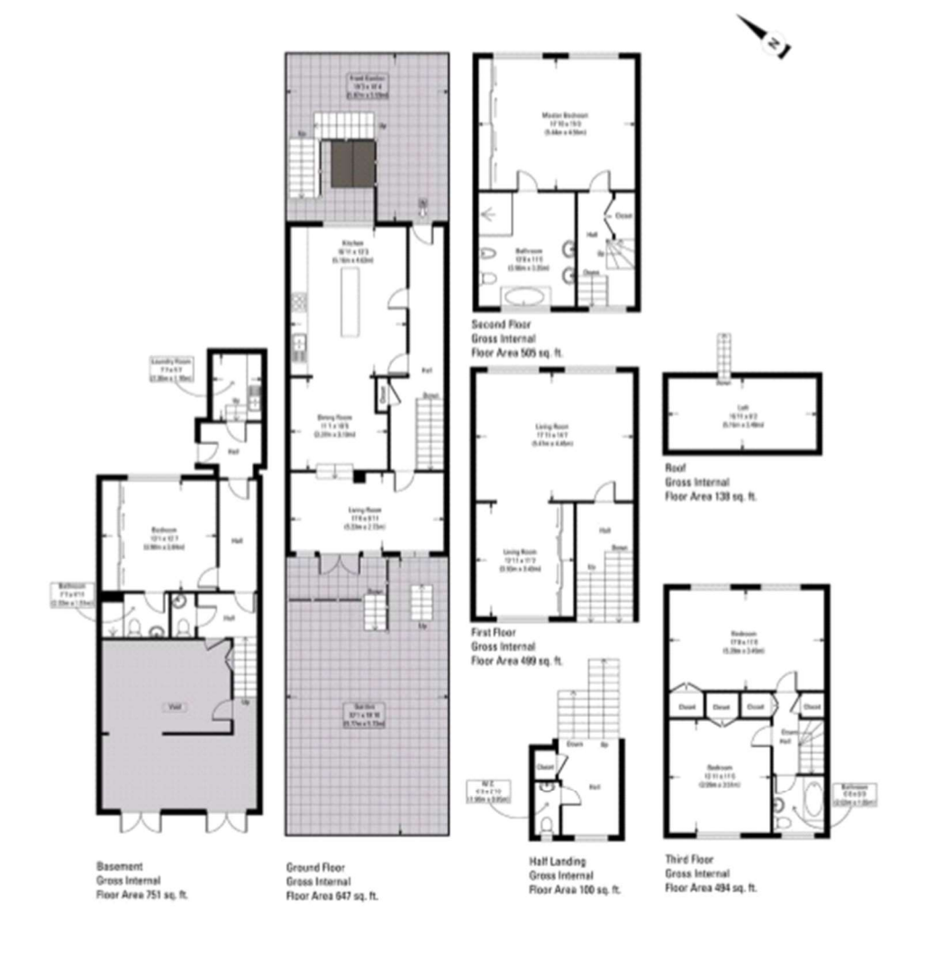
Approx. Gross Internal Floor Area 2820 Sq. Ft. / 262 Sq. M. Floor plans are for illustrative purposes only and not to scale. Compliant with RICS code of measuring practice.

*Tenant admin fee: 1 person (£100 + VAT), 2 people (£200 + VAT), 3 people (£250 + VAT), 4 people (£300 + VAT), Referencing: £30 per person, Renewal Agreement fee: £50 (including VAT. Typical deposit equal to 6 weeks rent and rent is paid in advance (normally monthly or quarterly). There will be a check out fee at the end of the tenancy, the price of which will depend on the size of the property. N.B. We have produced these sales particulars as a general guide. It is essential that you check with us before undertaking an inspection. We have not carried out a detailed survey of the property and have not tested the services, appliances or specific fittings. Room sizes are for general guidance purposes and should not be relied upon for fitting carpets or furnishings. Pictures may have been digitally enhanced. Floor plans are not to scale. Fittings shown on floor plans may not match the actual layout or size of fittings at the property. None of the statements as to the property contained in these particulars are to be relied upon as statements or representations of fact. All statements in these particulars as to this property are made without responsibility on the part of Homesite. The vendor does not make or give and neither Homesite nor any person in their employment has the authority to make or give any representation or warranty whatever in relation to this property.