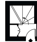
First Floor Entrance